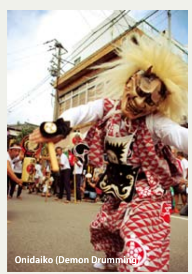
Sado Performing Arts

Since 1971 Sado Island has been our home and the platform from which we reach out to the world. With nature's warm embrace evident in each of her four seasons, Sado is an extraordinary place where traditional ways of life and the island's indigenous performing arts still thrive today. This island is the fountain of our inspiration and the guiding force behind our creative lifestyle. Our goal is to find a harmonious balance between people and the natural world. Each time we venture off the island we encounter new people, customs, and traditional performing arts that are ingrained in the lifestyles of each locale. Both similarities and differences prompt us to pause and reflect upon the importance of the varied and rich cultures that color our world. These life lessons permeate our very skin and become an invisible source of our expression. It is through this process of "Living, Learning, and Creating" that we cultivate a unique aesthetic and sensitivity, reaching out toward a new world culture rooted in the rich possibilities of a peaceful coexistence between humanity and nature.