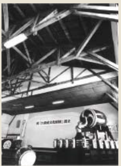
"O-daiko" performance at the Kodo Apprentice Centre commemorating the birth of the Kodo Cultural Foundation in 1997

Thanks to the support of many friends, the Kodo Cultural Foundation was established in 1997 in order to increase Kodo's capacity for outreach projects on our home of Sado Island. Its primary mission is to carry out non-profit activities focused on social education and the notion of giving back to the local community. The Kodo Cultural Foundation is committed to the cultural and environmental preservation of Sado Island and oversees many ambitious projects. From the conservation of local habitats to the revitalization of rare craft traditions and Noh theaters throughout Sado Island, the highly collaborative Kodo Cultural Foundation supports many vital initiatives. If Kodo's performances were likened to a garden, then the foundation would be the roots of the plants growing there. Its activities include holding workshops, planning the annual Earth Celebration, creating a research library, managing the Kodo Apprentice Centre and the Sado Island Taiko Centre, and carrying out research in the performing arts.