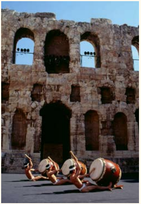
Odeon of Herodes Atticus, Acropolis, Athens (1995)

Our performance begins with the blending of these three elements with our lives amid the sights and sounds of Sado Island. It is then forged into shape on the anvil of rehearsal.