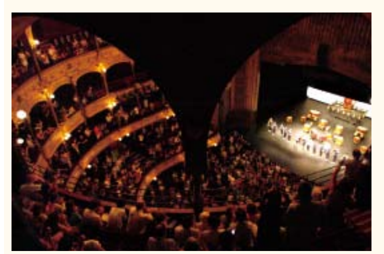
Théâtre du Châtelet, Paris (2009)

The world is a kaleidoscope of people and cultures. In this age of exploding populations and lightening-fast communication, it is more important than ever that diverse cultures learn to understand and accept each other so that all may share our increasingly shrinking planet in harmony. Since ancient times the taiko has been a symbol of community, serving as a link among people, as well as a link between people and the heavens. Through the One Earth Tour , Kodo has given over 3,400 performances in 46 countries around the globe, making the group Japan's most internationally acclaimed performing art ensemble. Kodo will continue to bring the sound of the Japanese drum around the globe, and with the taiko's unique ability to transcend the barriers of language and custom, remind us all of our membership in that larger community -- the world.