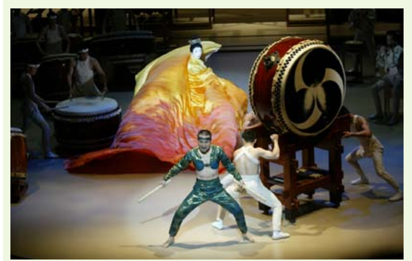
Amaterasu with Kabuki luminary Tamasaburo Bando. Premiere season in 2006, with encore performances in 2007

In tandem with the One Earth Tour , Kodo also works intensively on collaborations with leading artists from a wide range of genres including world music, classical, jazz, rock, and dance. The group is also invited to perform in countless international events, ceremonies and festivals.