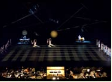
Monoprism with the New Japan Philharmonic in Tokyo (2008) and with Italy's highly acclaimed Orchestra of the Accademia Nazionale di Santa Cecilia in Rome (2009). Ballet Kaguyahime at Opéra national de Paris Bastille (2010)