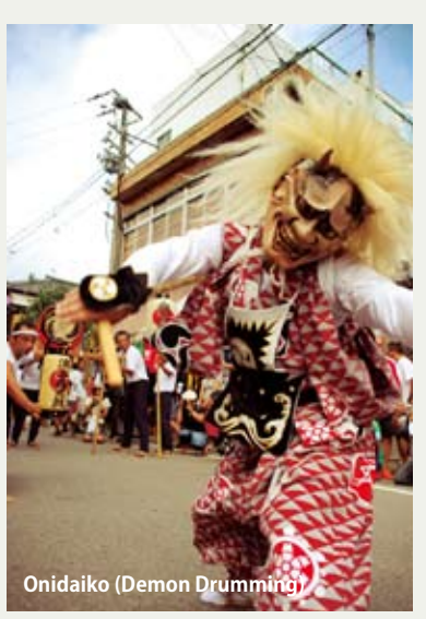
Sado Performing Arts

Since 1971 Sado Island has been our home and the platform from which we reach out to the world. With nature's warm embrace evident in each of her four seasons, Sado is an extraordinary place where traditional ways of life and the island's indigenous performing arts still thrive today. This island is the fountain of our inspiration and the guiding force behind our creative lifestyle. Our goal is to find a harmonious balance between people and the natural world. Each time we venture off the island we encounter new people, customs, and traditional performing arts that are ingrained in the lifestyles of each locale. Both similarities and differences prompt us to pause and reflect upon the importance of the varied and rich cultures that color our world. These life lessons permeate our very skin and become an invisible source of our expression. It is through this process of "Living, Learning, and Creating" that we cultivate a unique aesthetic and sensitivity, reaching out toward a new world culture rooted in the rich possibilities of a peaceful coexistence between humanity and nature.